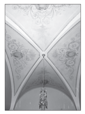
Restored ceiling in S-224

then available. Many of the offices in the new wing have groin-vaulted ceilings, monumental doors and windows set in ornate castiron frames, carved marble fireplace mantels, and colorful and intricately patterned English floor tiles from Minton & Company.