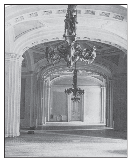
View of the principal corridor near the Senate Chamber from room S-224, ca.1860

This desirable office space was first assigned to the Office of the Secretary of the Senate, whose responsibilities necessitate access to the Chamber floor. The secretary plays an essential role in the functioning of the Senate, overseeing an array of legislative, administrative, and financial services needed for the daily operation of the Senate.