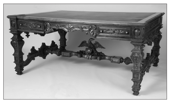
The Rococo table in S-223

The highly ornamented Rococo table in S-223 was originally purchased for the Vice President's Room in 1860. The table remained in the room until 1898 and was used by ten vice presidents.