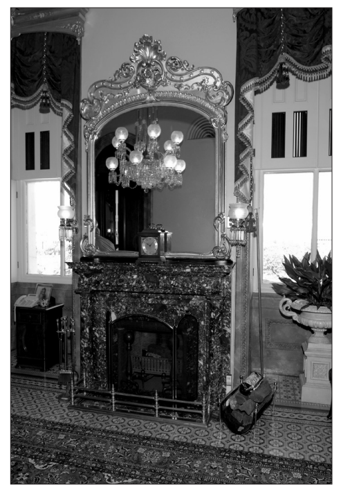
Fireplace mantel and mirror in S-223

The suite is lighted throughout by nickel-plated brass and crystal chandeliers. While not the original light fixtures, these crystal chandeliers are 1910s copies of chandeliers from the White House. According to accounts, seven White House chandeliers were installed in the Capitol and generated so much interest that replicas were produced for many offices.