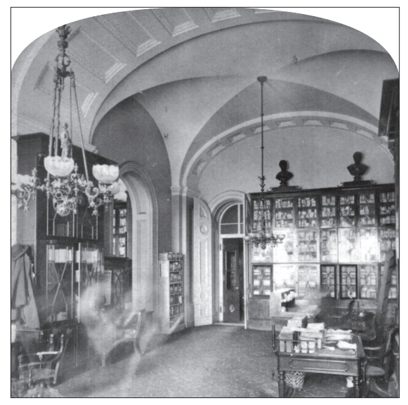
View of S-221, ca.1860