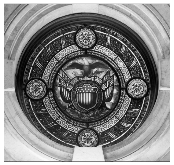
Stained glass window in S-222

Another uncommon architectural element is found in S-222, and is one of only four in the Capitol. The stained glass window depicting a shield, an eagle, flags of the U.S., and the motto E Pluribus Unum (Out of many, one), garners attention. The window provides light to the lower staircase on the other side of the wall, thus accounting for its seemingly unusual placement.