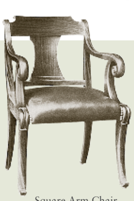
Square Arm Chair

In December 1908 the superintendent and the Building Commission decided to finish the building floor by floor, instead of wing by wing, requiring 40