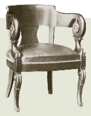
Round Arm Chair