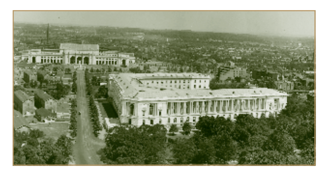
The Russell Senate Office Building, ca. 1920s.