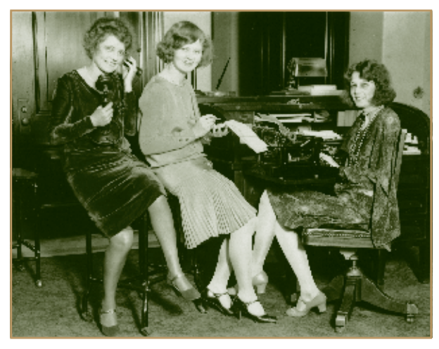
Charles Curtis (and his secretarial staff shown above) continued to use a Russell suite after the senator became vice president, 1929.

The Russell furnishings were the largest single furniture contract issued by the Senate, numbering thousands of pieces, each one carefully designed and custom built from the finest materials. The furniture continues to be used daily and is prized by senators and staff. Its beauty and quality complement the rich Beaux Arts grandeur of the Senate's first office building.