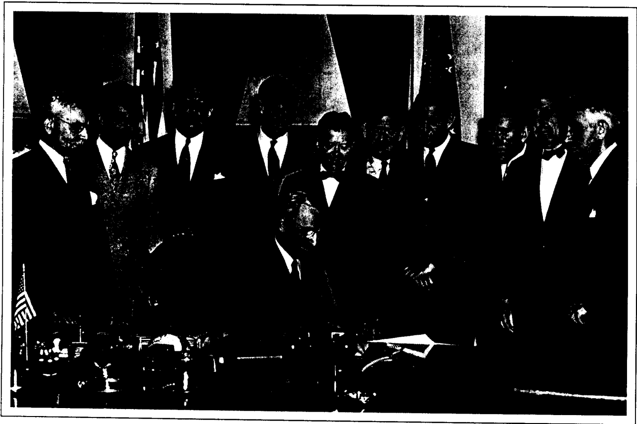
At the White House, members of Congress watched as President Truman signed the Legislative Reorganization Act on August 2, 1946.