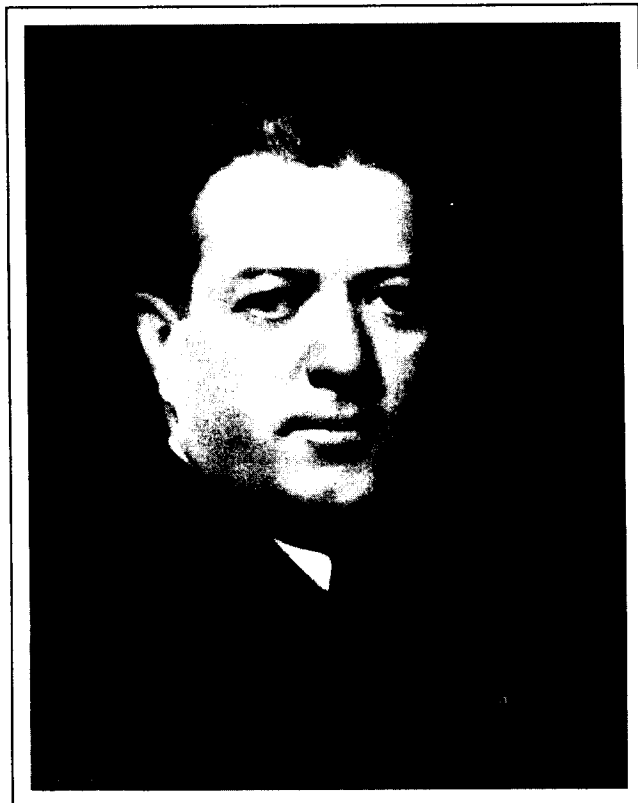
In 1946, Robert M. La Follette, Jr., won passage of his reform bill and lost his reelection bid.

At the start of 1945, the strongest impediments to legislative reform were preoccupation with the final military operations in Europe and the suspicion by senior House members that they had little to gain and much to lose from a change in the status quo. Few could argue in principle with the study committee's concept, but reformers were apprehensive that congressional elders would kill the infant at the hour of its birth. Ac-