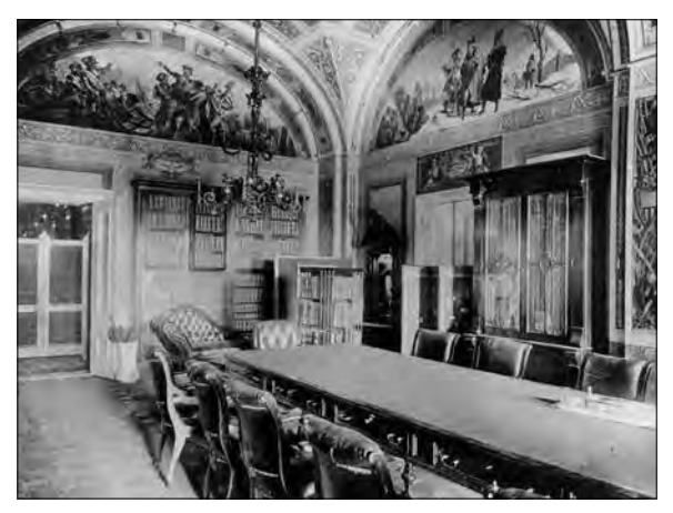
Room S–128 when used by the Senate Committee on Military Affairs, ca. 1900

The room itself was decorated over a 15-year period by Brumidi and English artist James Leslie; Brumidi painted the lunettes with Revolutionary War scenes— The Boston Massacre , 1770; The Battle of Lexington (1775); Death of General Wooster , 1777; Washington at Valley Forge , 1778; and Storming of Stony Point , 1779—while Leslie painted the pilasters with elaborate military arms representing different historical periods. The ornate gilded valances and mirror over the marble mantel are also decorated with military accouterments. In a eulogy to Brumidi, shortly after his death, Senator Daniel Voorhees of Indiana praised the decorations and reflected: "Who ever passed through the room of the Committee on Military