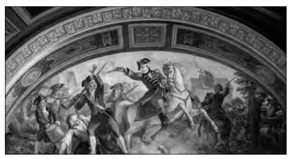
The Battle of Lexington, S-128

Affairs without the feeling that the very genius of heroism had left there its immortal aspirations?" The elaborate floor tiles were manufactured by Minton, Hollins and Company of Stoke-Upon-Trent, England. Despite nearly 150 years of service, the tiles remain in excellent condition due to a unique "encaustic" tile-making process that used layers of colored clay embedded in a neutral clay base to enhance color and durability.