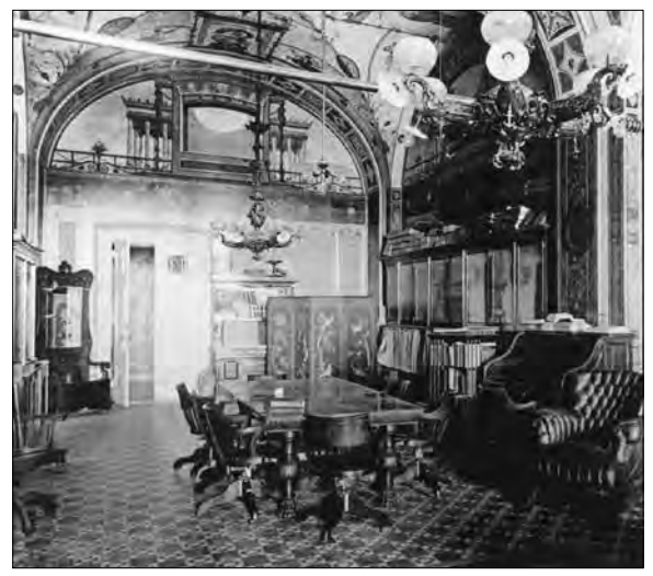
Room S–127 when used by the Senate Committee on the Philippines, ca. 1900

S-127. The main committee room was first occupied by the Committee on Naval Affairs, and the art reflects a naval theme. The decoration is in a style derived from ancient Roman wall paintings in the Baths of Titus and the excavations of Pompeii. As originally designed by Brumidi, the upper walls were to be filled with depictions of U.S. naval battles in illusionistic porticoes. Because of dissatisfaction with the artists who were to have carried out the work, only one scene was completed. The highly ornate ceiling as executed by Brumidi and his assistants is painted in fresco and tempera. Seven Roman gods and goddesses of the sea, together with America in the form of a Native American woman, dominate the ceiling. Interspersed throughout are scenes of mermaids, centaurs, eagles, Native Americans, and settlers. The walls depict classical maidens in flowing robes with various naval instruments. Other original details in the room include the marble mantel, gilded mirror, and wooden shutters. The central chandelier, originally gas-burning and purchased in 1873 for the White House, was later acquired for the Capitol and modified