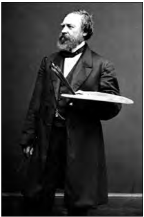
Constantino Brumidi, ca. 1866

The Senate Appropriations Committee's suite of offices is perhaps the most elegant of all Senate or House committee quarters. The seven rooms span the west side of the first floor in the Senate wing of the U.S. Capitol; the wing was built in the 1850s to accommodate the growing legislature. In 1911 the Appropriations Committee moved from second floor quarters into these rooms, first occupying rooms S–127, 128, and 129, and eventually expanding into adjacent rooms S–125, 126, 130, and 131.