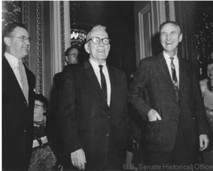
Majority Leader Mike Mansfield (right) with Senators Vance Hartke (D-IN) and George Aiken (R-VT).