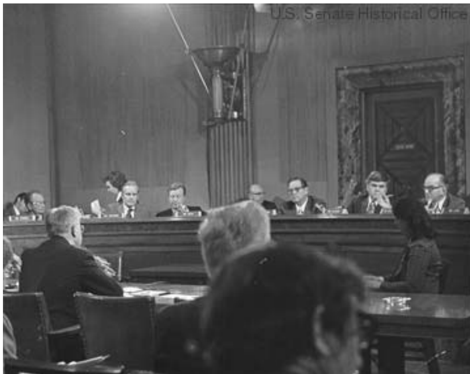
Senator William Proxmire (second from left at dais), at a hearing before the Joint Economic Committee. Seated next to Proxmire is Senator William Roth (R-DE).